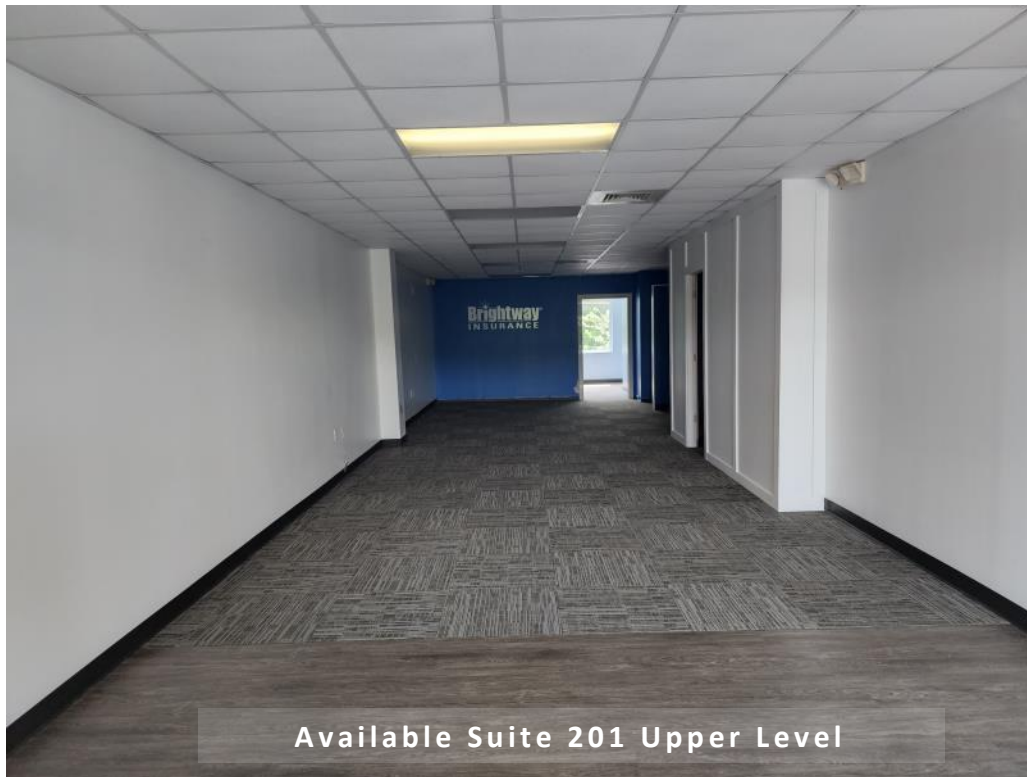
Available Suite 201 Upper Level