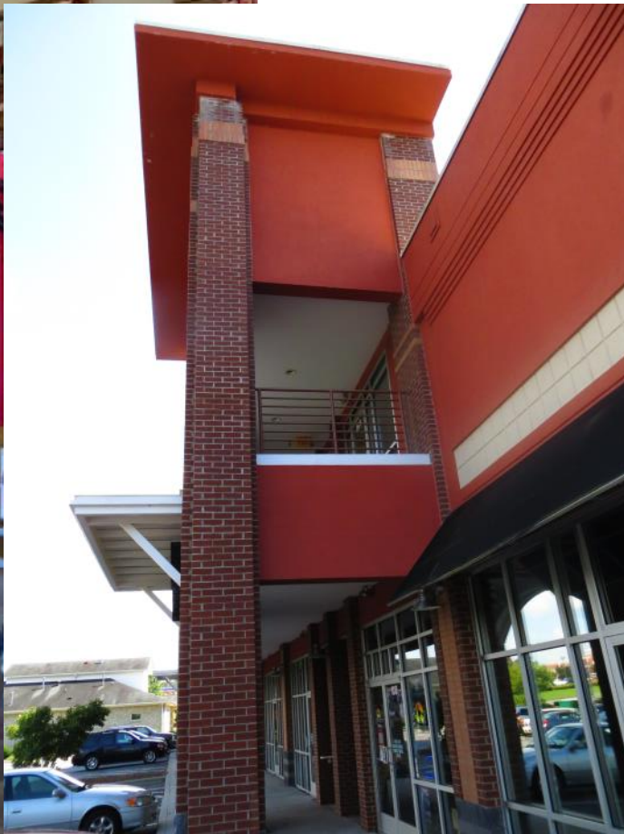
Ground Level Retail Endcap #101