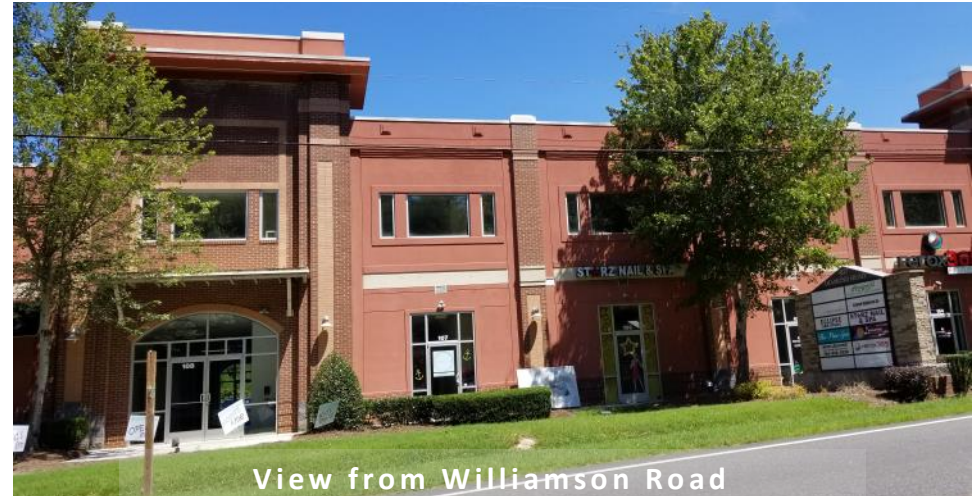
View from Williamson Road