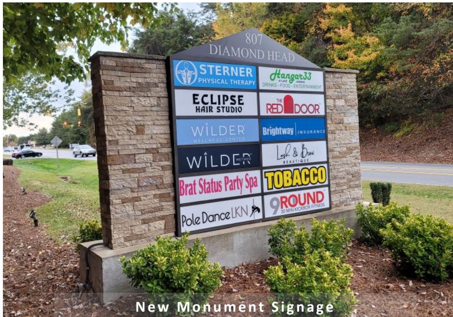
New Monument Signage