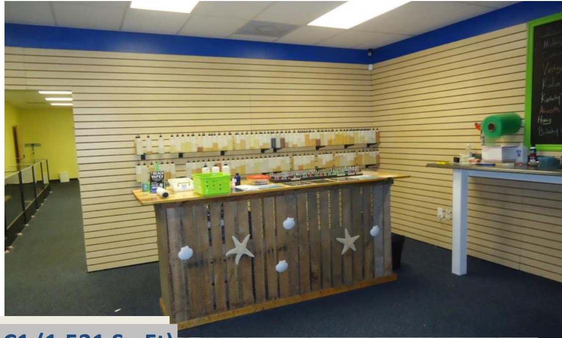
Space 400-C1 (1,531 Sq Ft)