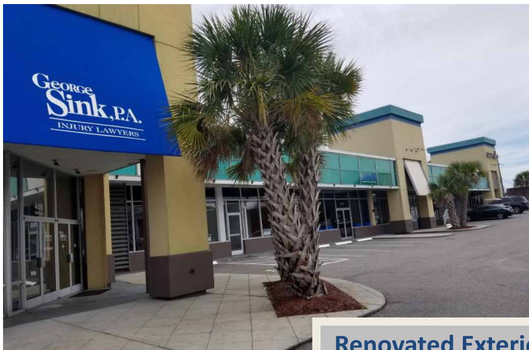
Renovated Exterior & Sign-