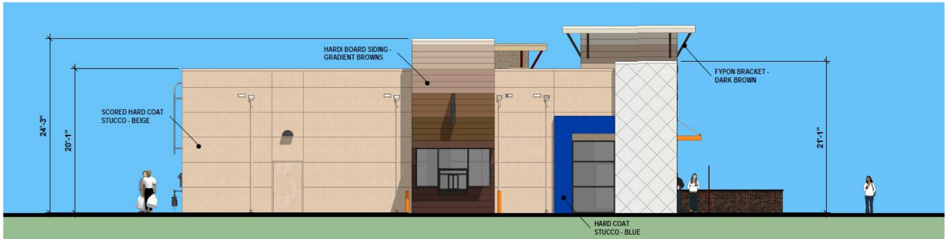
EAST ELEVATION (REAR)