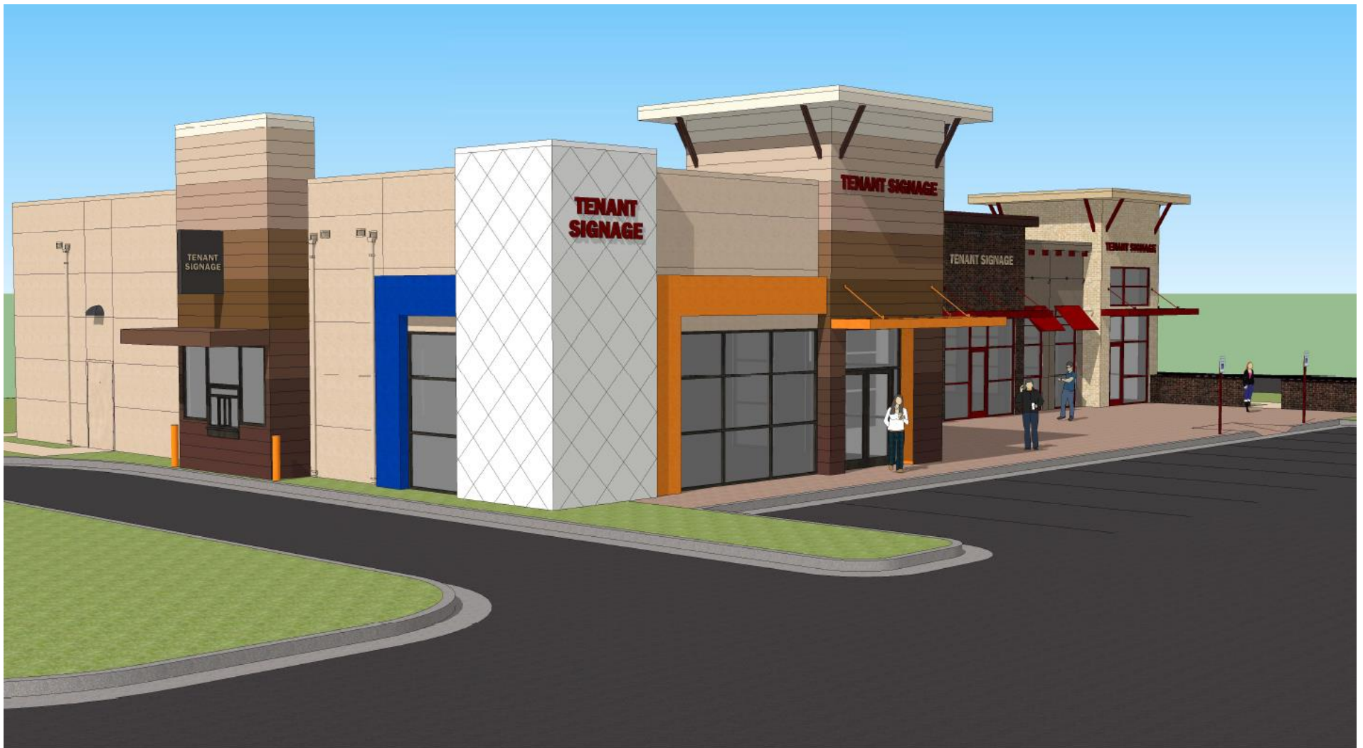
DRIVE THRU PERSPECTIVE