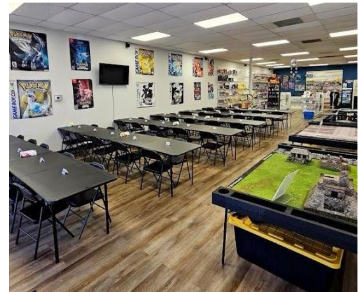
Suite 5309-C 1,200 SF: Former retail Store