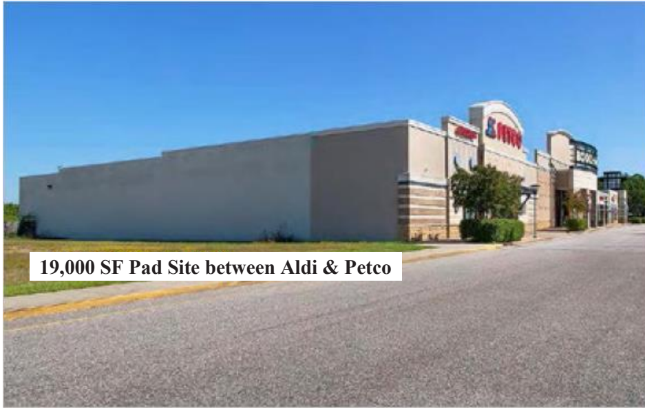
19,000 SF Pad Site between Aldi & Petco

Great build-to-suit or ground lease opportunity with 250' of road frontage facing Eastern Blvd.