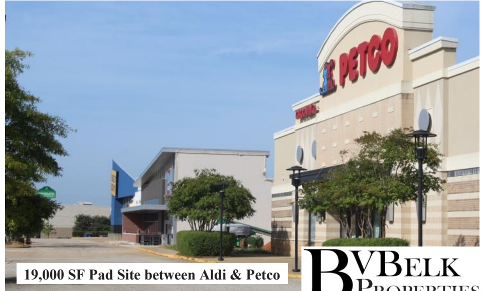
19,000 SF Pad Site between Aldi & Petco