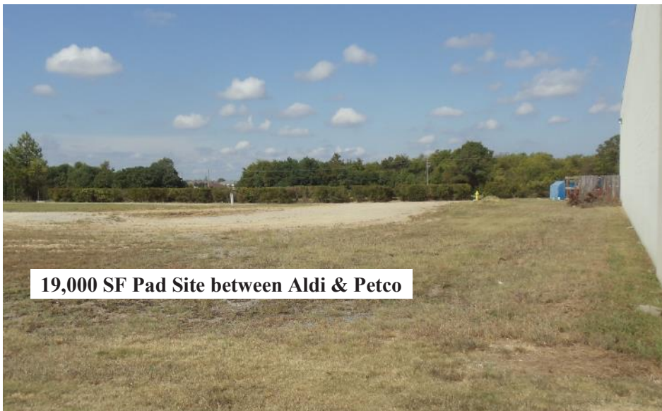
19,000 SF Pad Site between Aldi & Petco