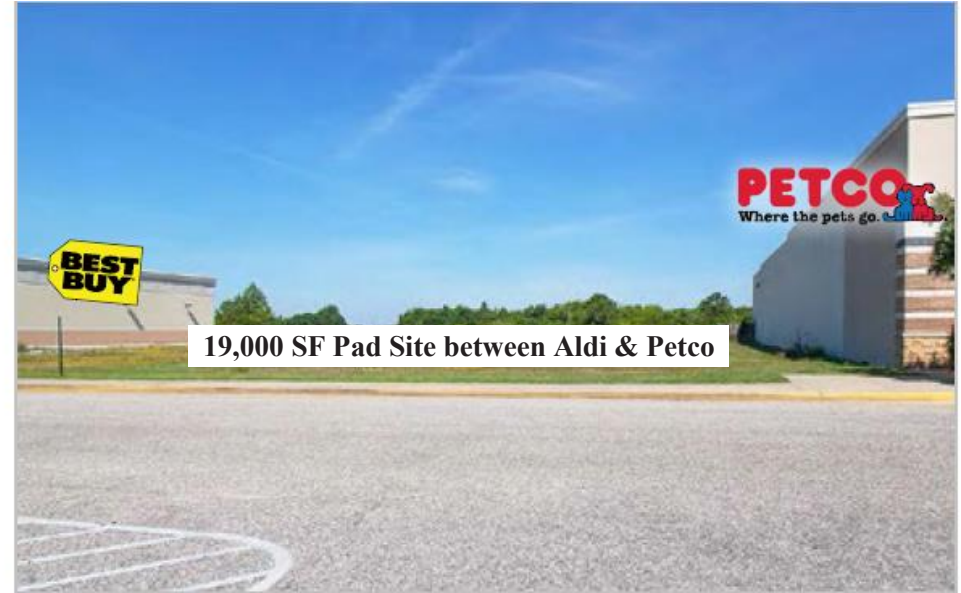
19,000 SF Pad Site between Aldi & Petco