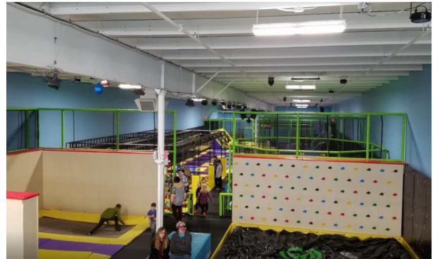
New Trampoline Park