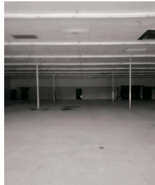
Former Just-Save grocery anchor space (15,300 SF)