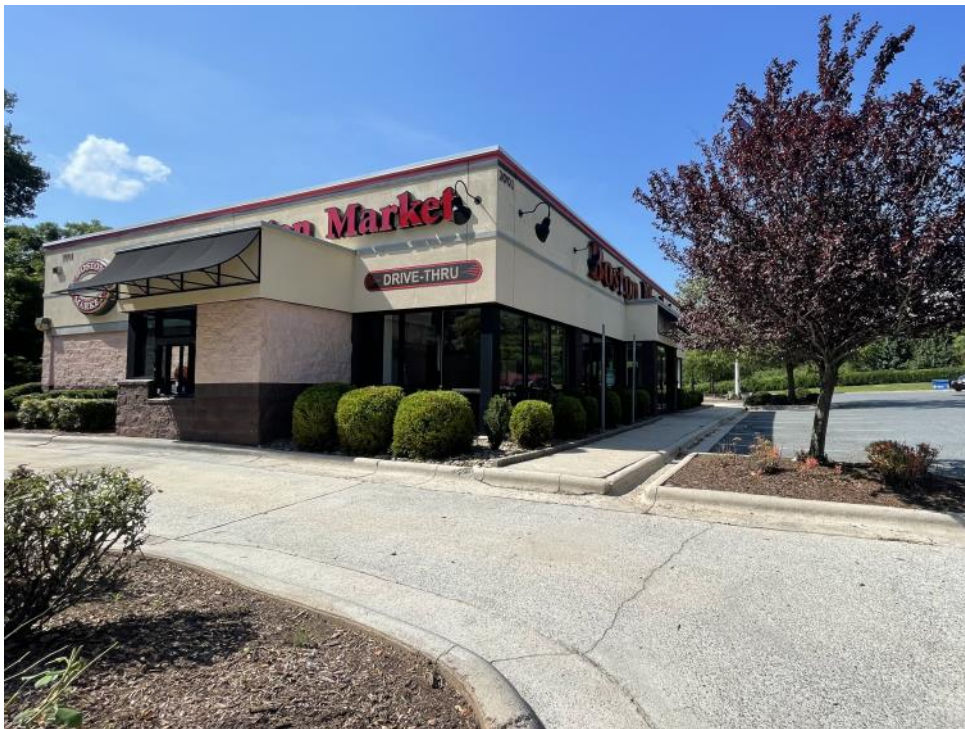
Outdoor patio area